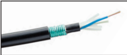
Double Jacket Armored Cable

Loose Tube – Outdoor, and Indoor/Outdoor Riser Rated